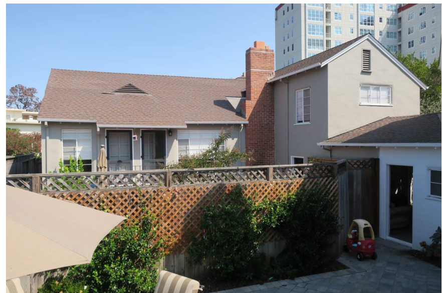
VIEW TO EAST TOWARD 29 BAYTREE