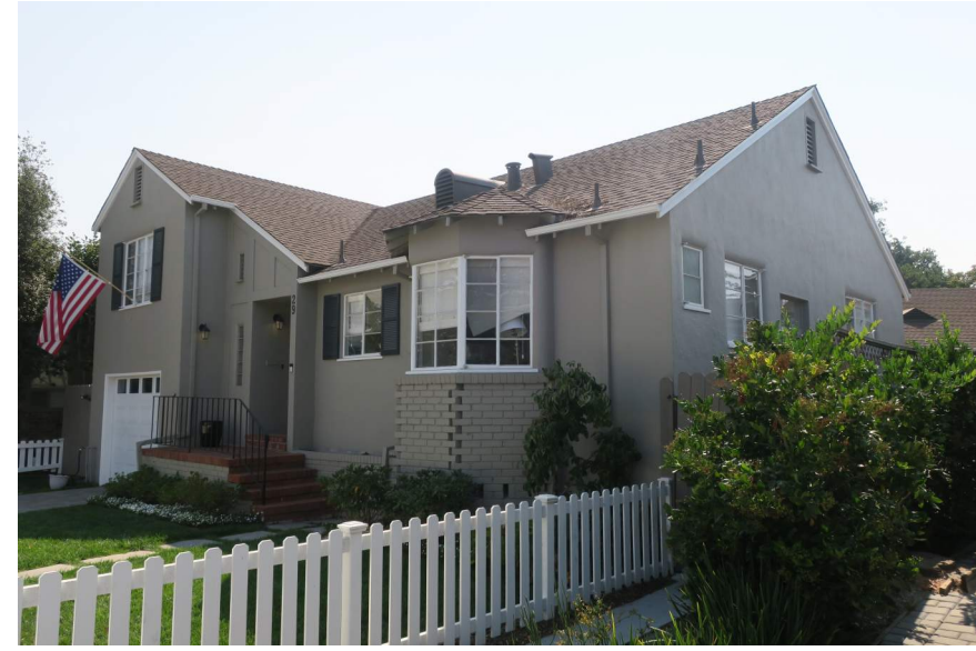
VIEW TO SOUTH TOWARD 29 BAYTREE