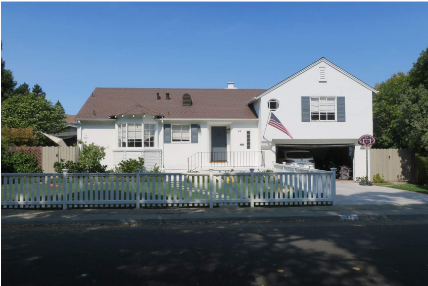
VIEW TO NORTHEAST TOWARD 22 DE SABLA