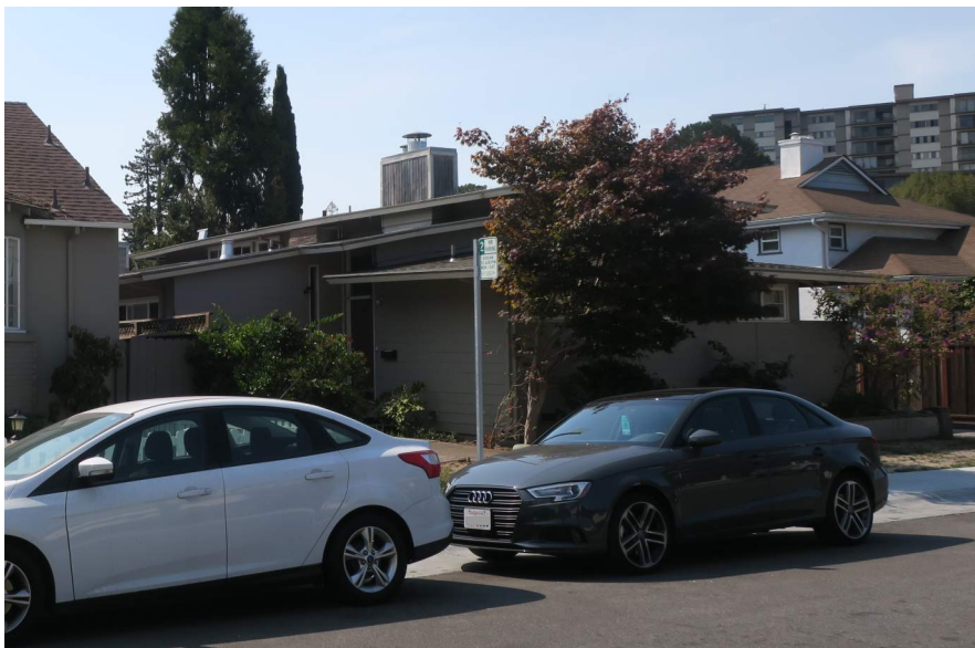
VIEW TO NORTHWEST TOWARD 33 BAYTREE AND 29 BAYTREE