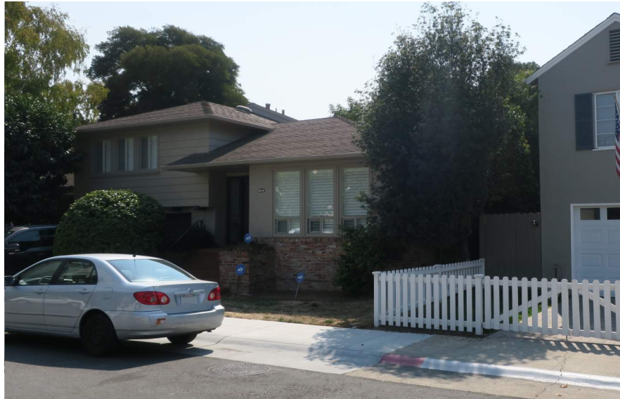
VIEW TO SOUTH TOWARD 25 BAYTREE AND 29 BAYTREE