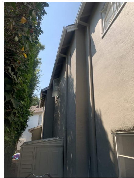
VIEW TO NORTHWEST 29 BAYTREE