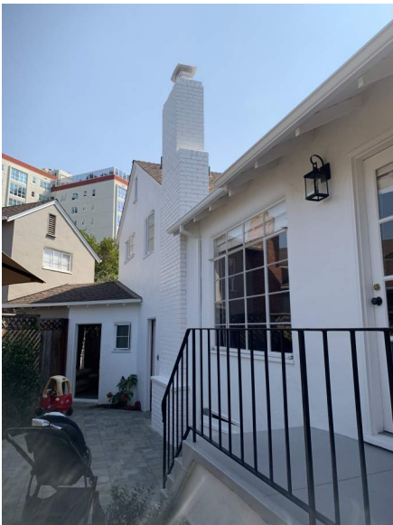
VIEW TO SOUTH TOWARD 22 DE SABLA