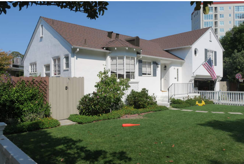
VIEW TO EAST TOWARD 22 DE SABLA