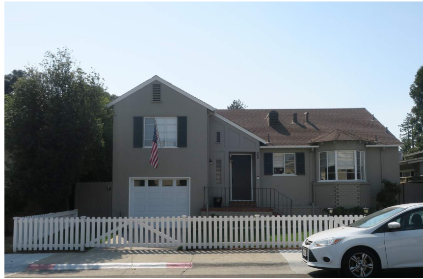
VIEW TO SOUTHWEST TOWARD 29 BAYTREE