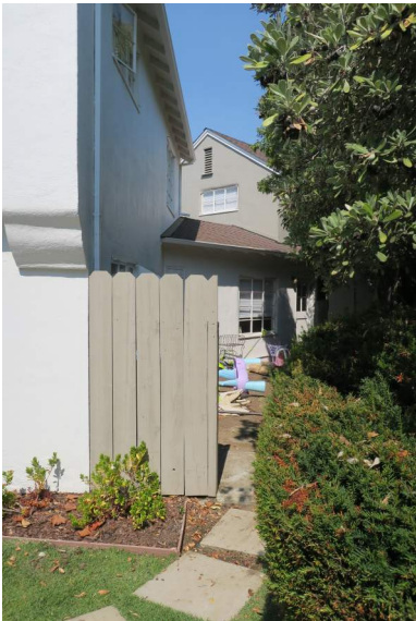
VIEW TO NORTH TOWARD 22 DE SABLA