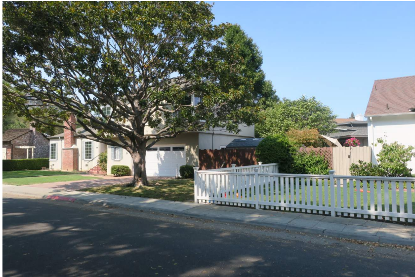
VIEW TO NORTH TOWARD 33 BAYTREE AND 22 DE SABLA