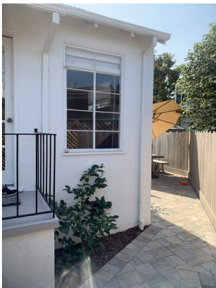
VIEW TO WEST TOWARD 22 DE SABLA