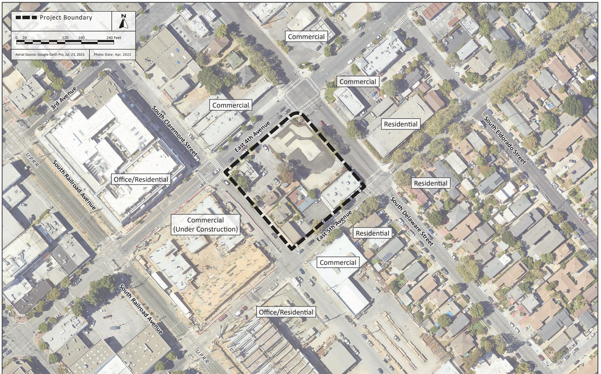
AERIAL PHOTOGRAPH AND SURROUNDING LAND USES