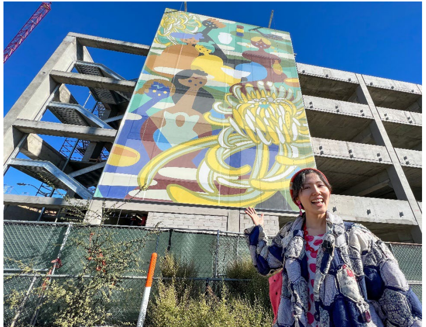
Artist Harumo Sato created three large murals for the Kiku Crossing parking garage and affordable housing development in Downtown San Mateo.

Harumo Sato, a Japanese visual artist who lives in the Bay Area, was selected to create the three murals that stand up to 54-feet tall on the Kiku Crossing parking garage. The prominent location means many visitors, residents and Caltrain riders will be able to appreciate the work that marks one of the largest public art installations downtown.