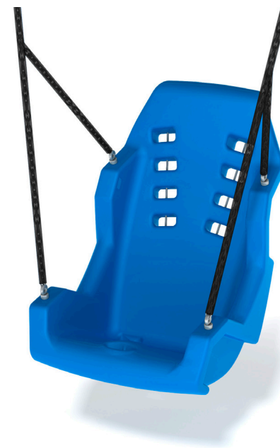
Mirage Swing Seat