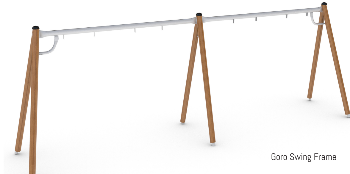
Goro Swing Frame