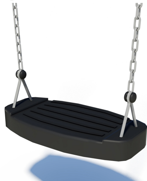
Katja Swing Seat