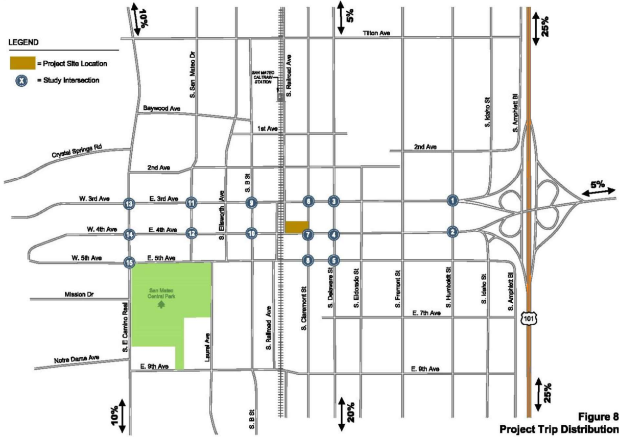
Figure 8 Project Trip Distribution