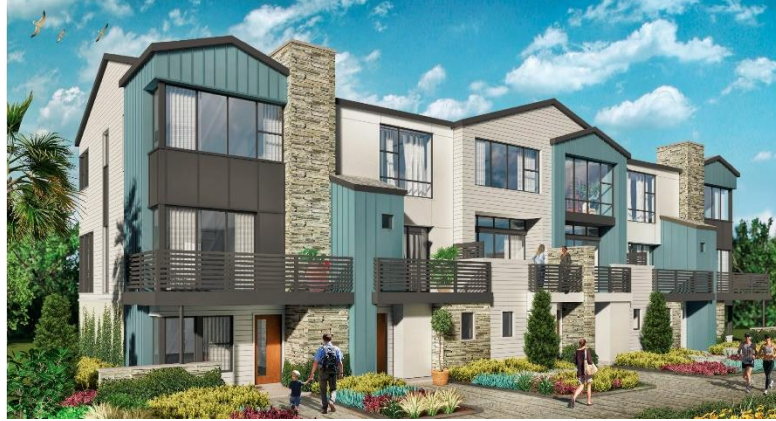
Precedent image of a similar approved Strada townhome development in Redwood City

MONDAY, DECEMBER 11, 2017 7:30 PM at City Council Chambers City Hall, City of San Mateo 330 West 20 th Avenue, San Mateo, CA 94403