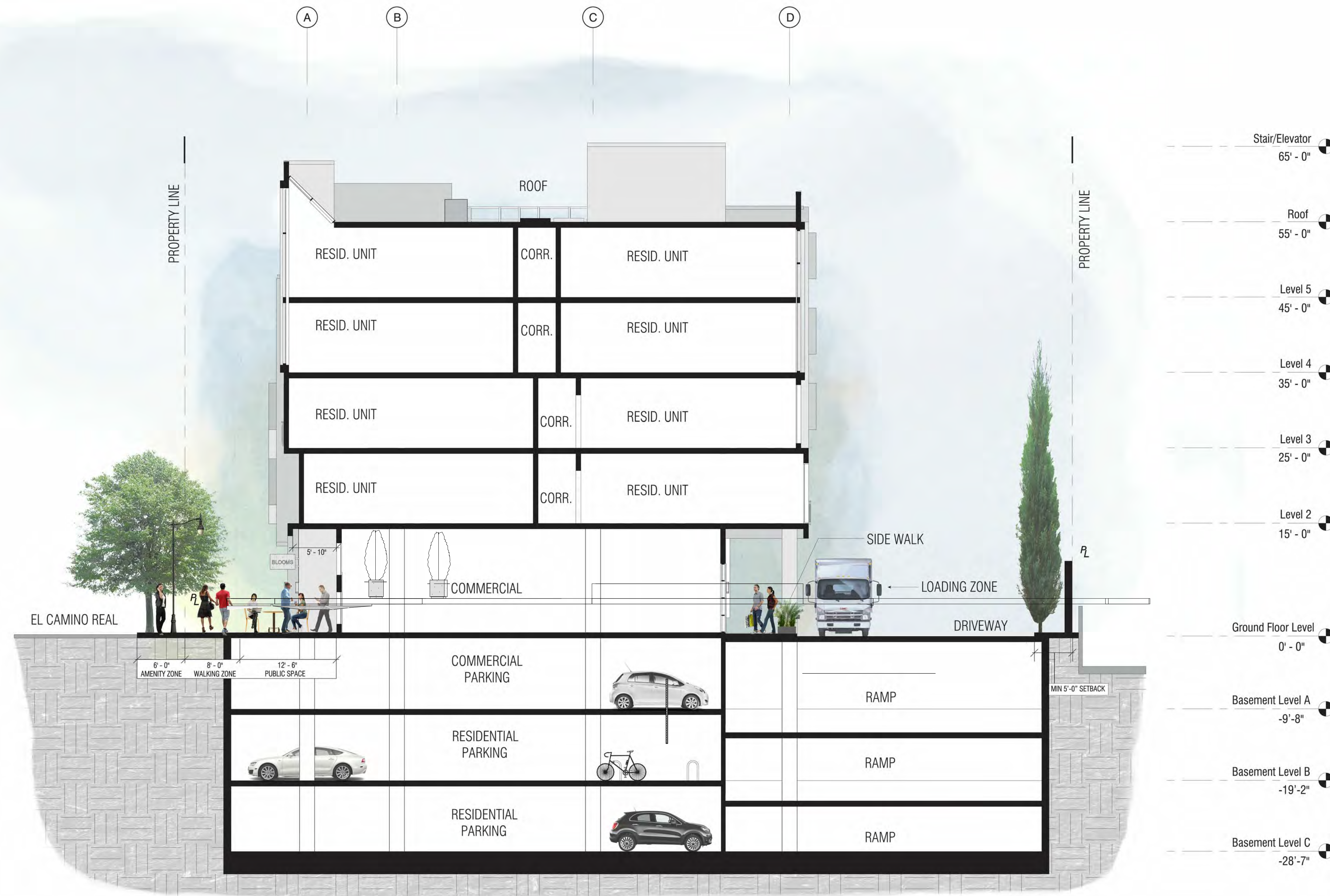
1 EAST FACING SECTION 1/8" = 1'-0"