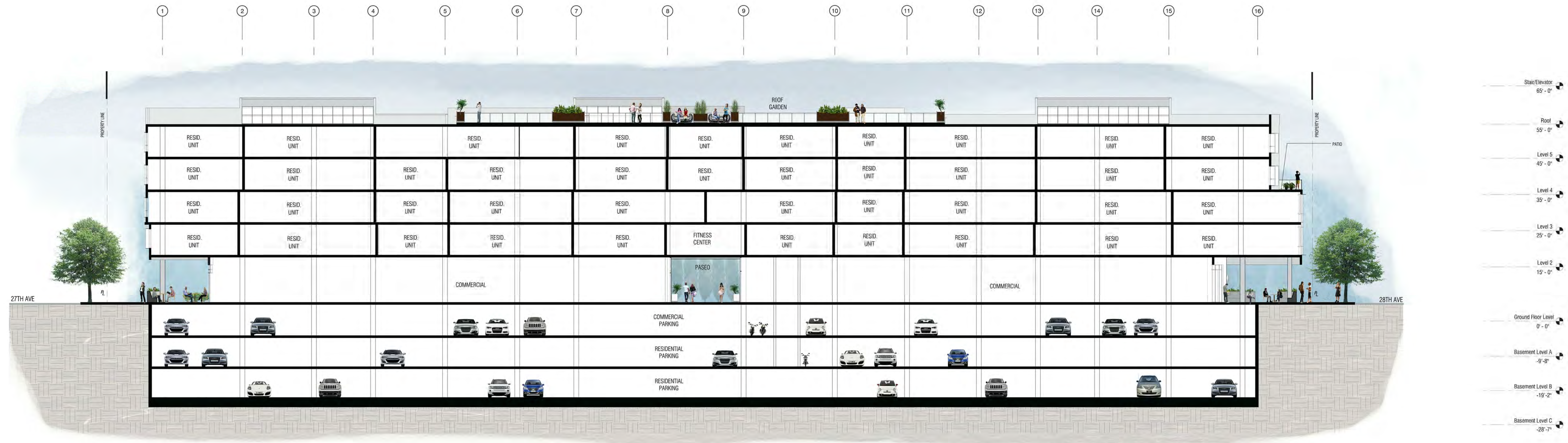
1 LONGITUDINAL SECTION 1/16" = 1'-0"