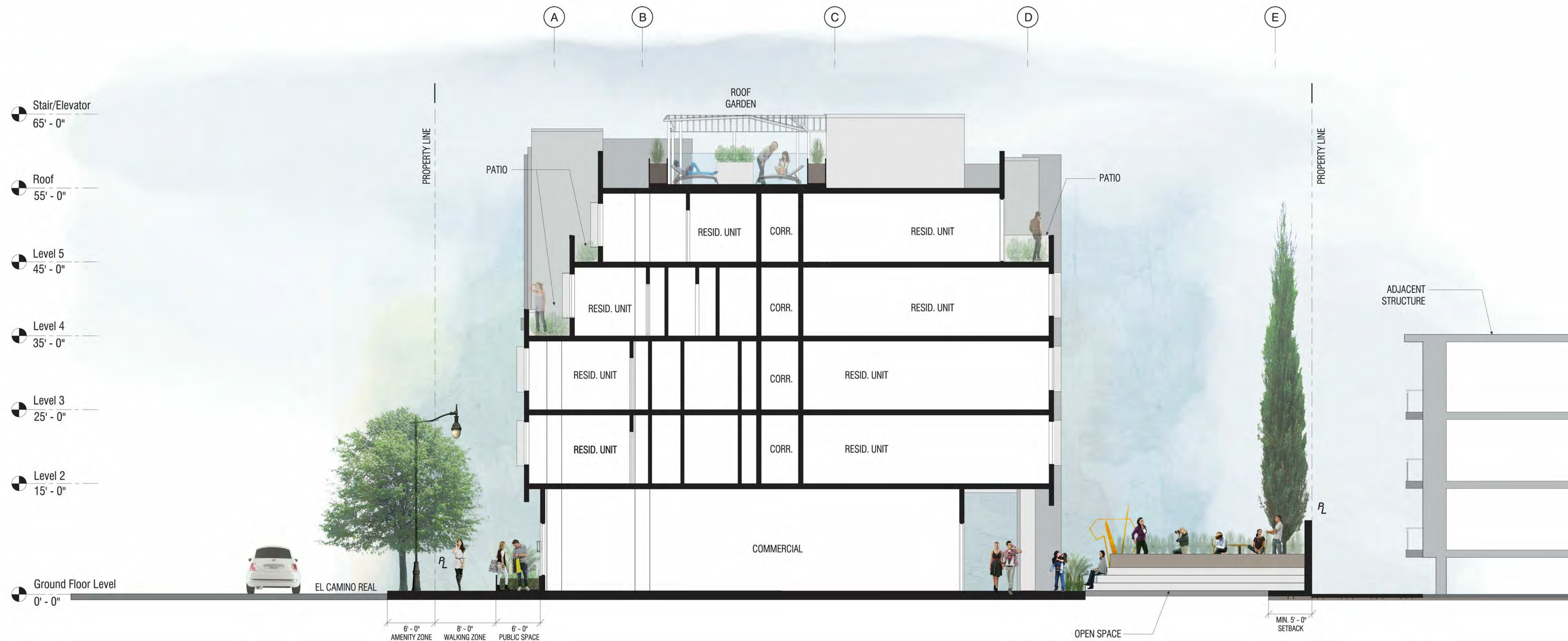
1 EAST FACING SIDEWALK SECTION 1/8" = 1'-0"