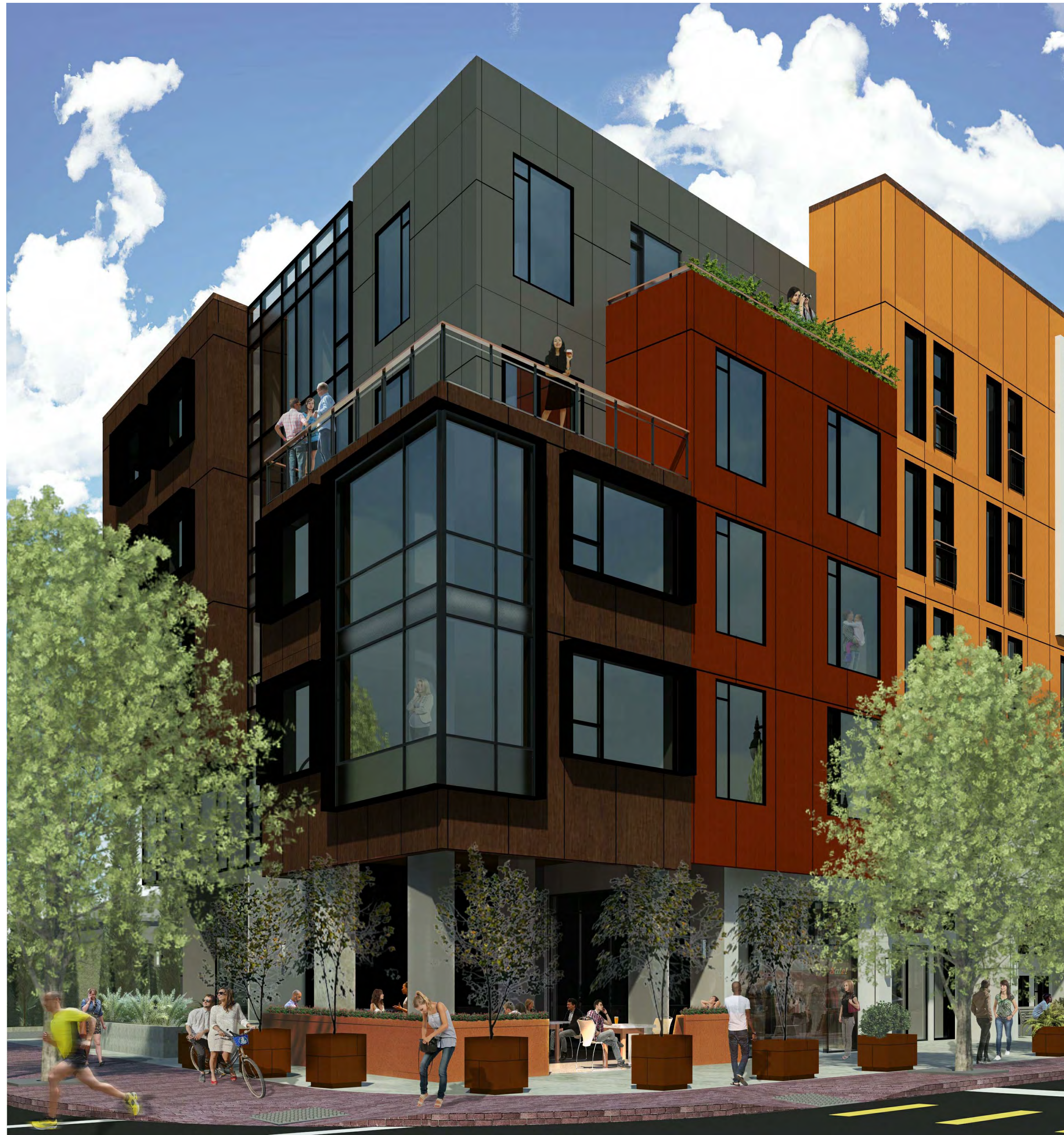
CORNER PERSPECTIVE AT SOUTH EL CAMINO REAL & 28TH AVENUE