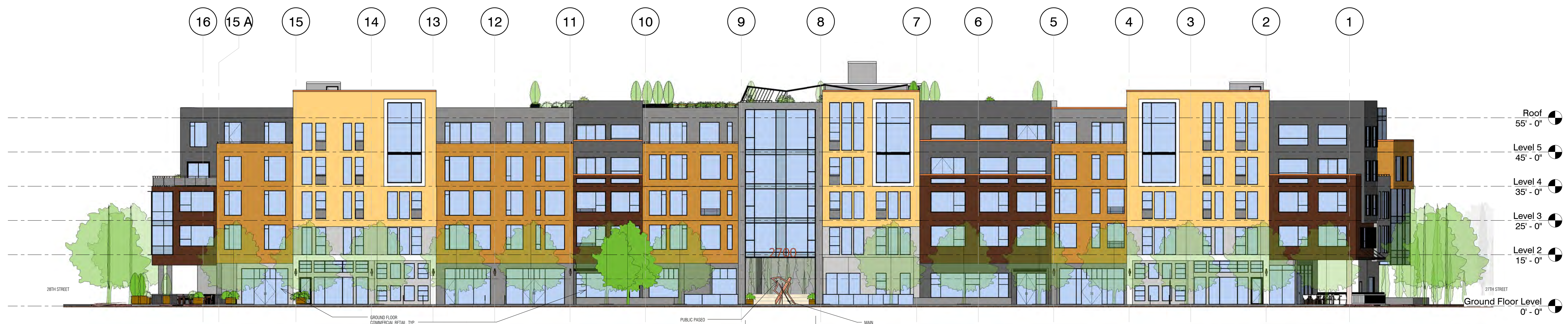
1 FRONT - NORTH ELEVATION - SOUTH EL CAMINO REAL 1/16" = 1'-0"