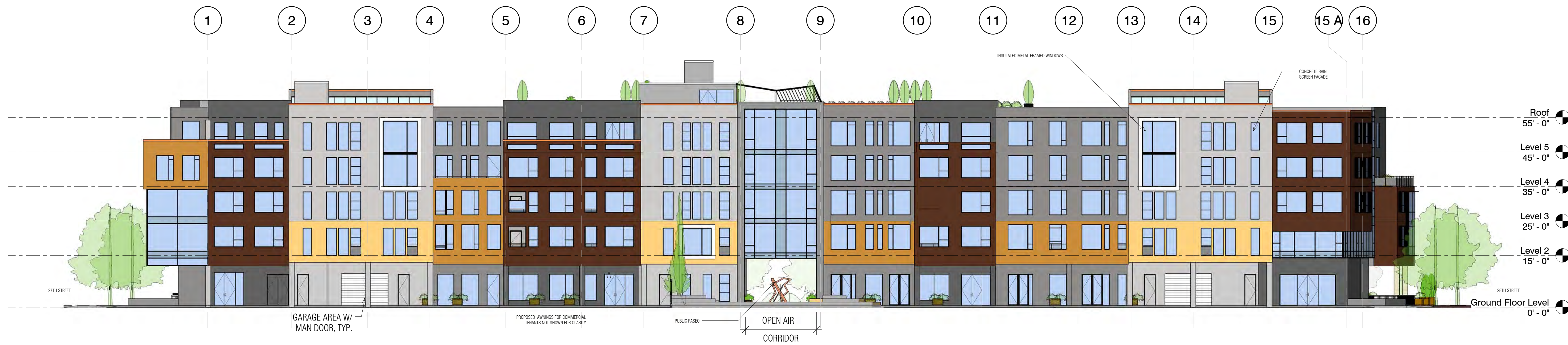
2 REAR - SOUTH ELEVATION 1/16" = 1'-0"