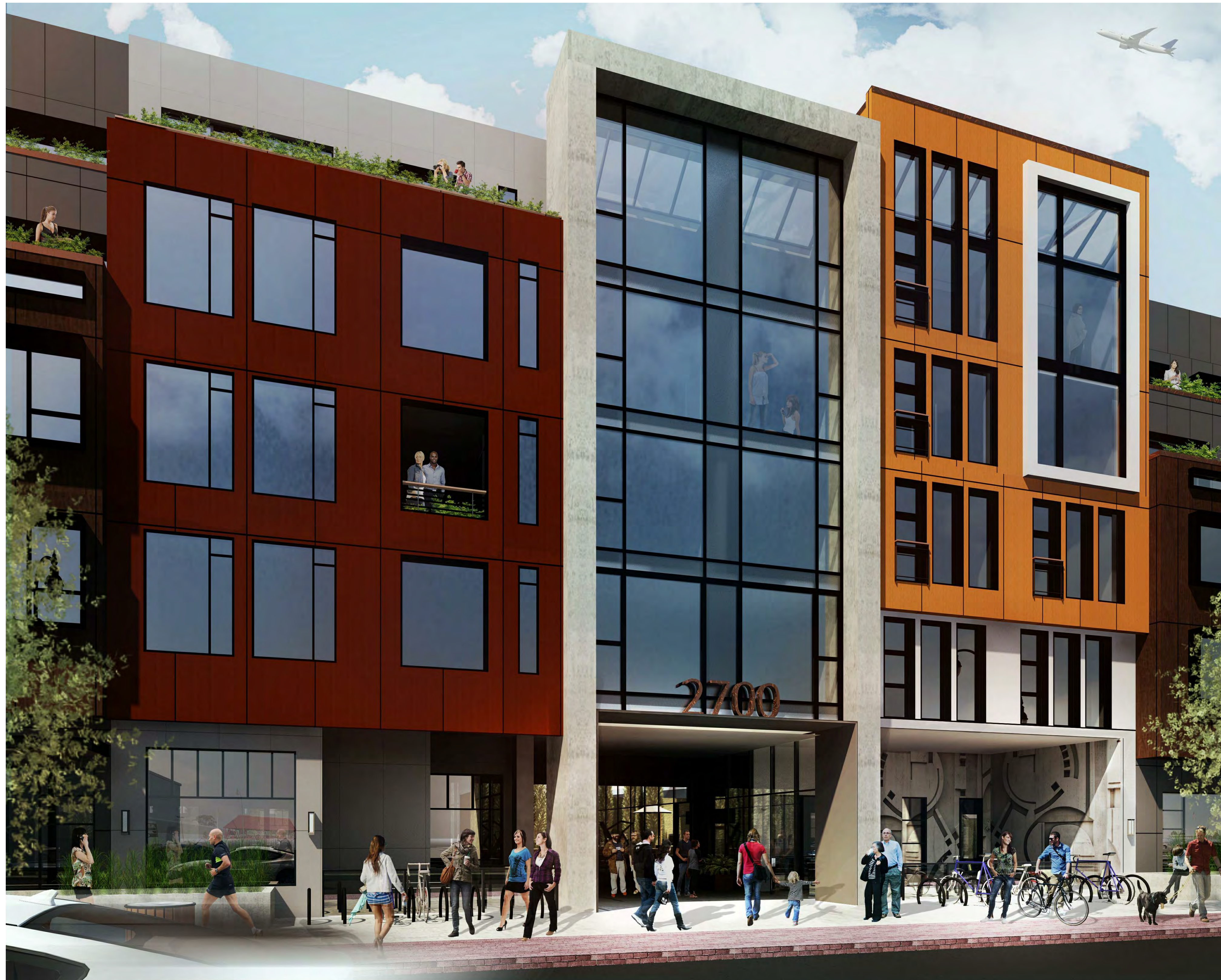
HILLSDALE TERRACES - MAIN ENTRANCE & PASEO