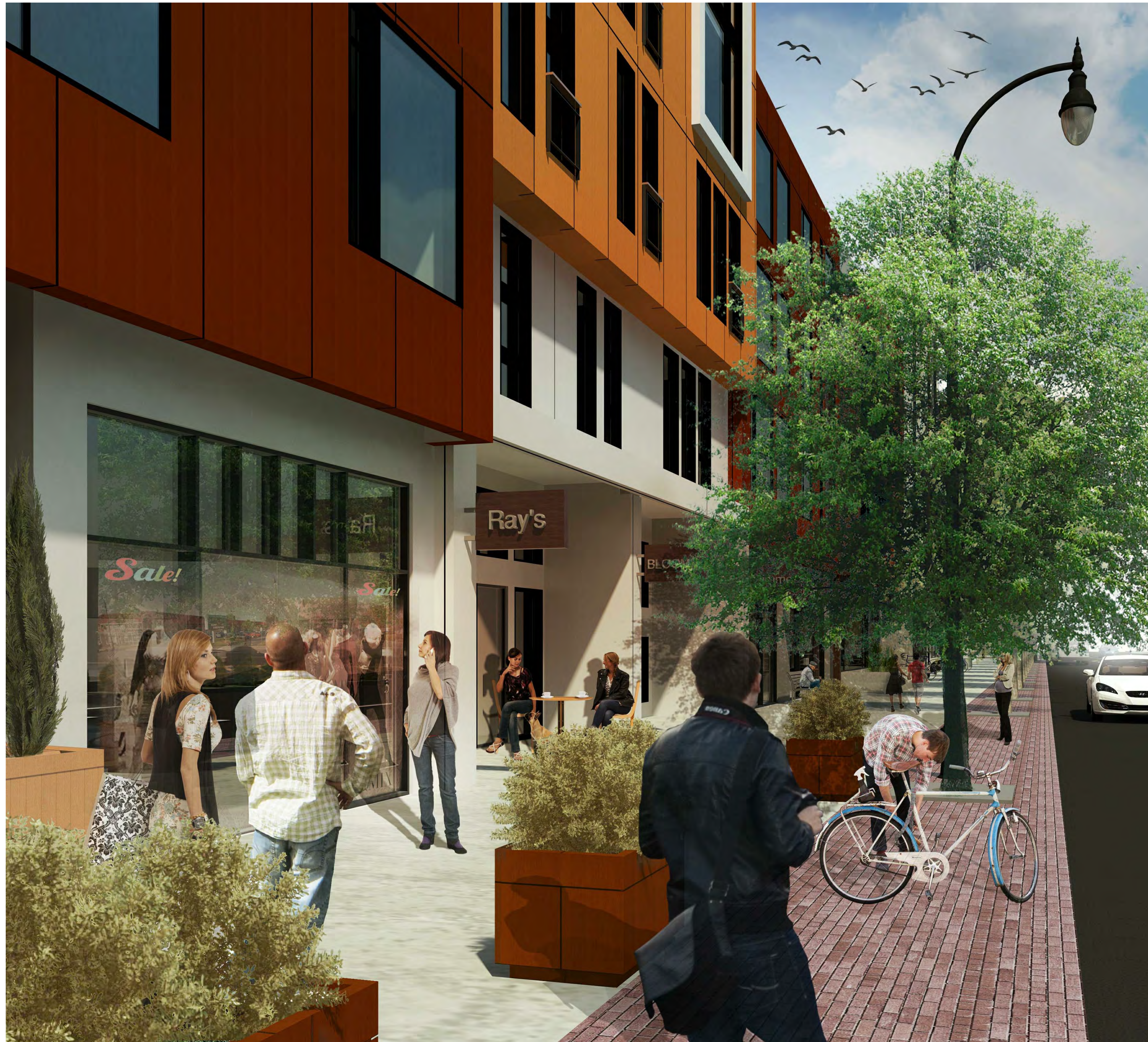
RETAIL PROMENADE - SOUTH EL CAMINO REAL